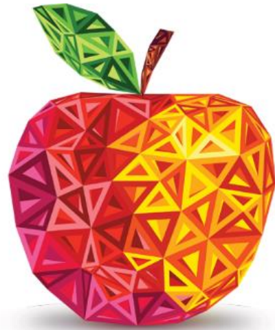
Fashion & Textiles