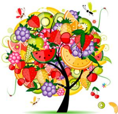
Health & Social Care