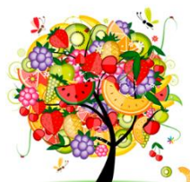
Health & Social Care