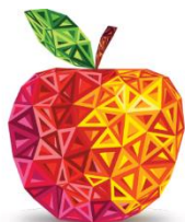
Fashion & Textiles