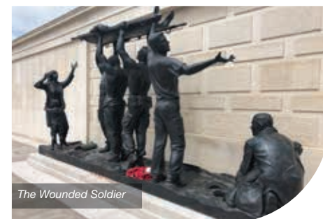
The Wounded Soldier