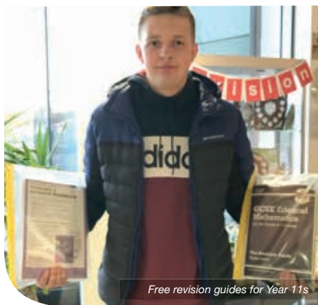
Free revision guides for Year 11s