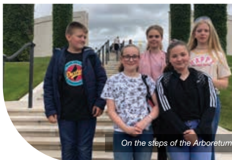
On the steps of the Arboretum

At the end of the day, students took part in a moving act of remembrance to commemorate the losses of the First and Second World Wars and all conflicts since 1945.